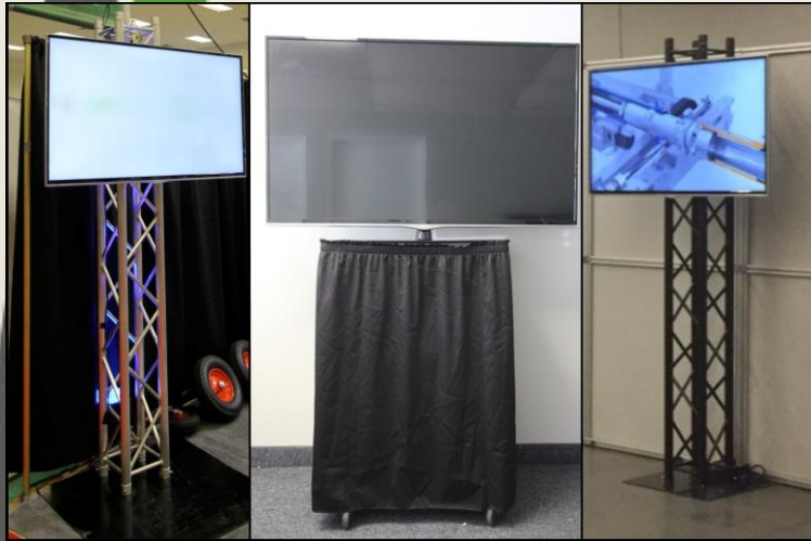
55" Smart TV Stand Options (Silver truss, AV Cart, Black truss)