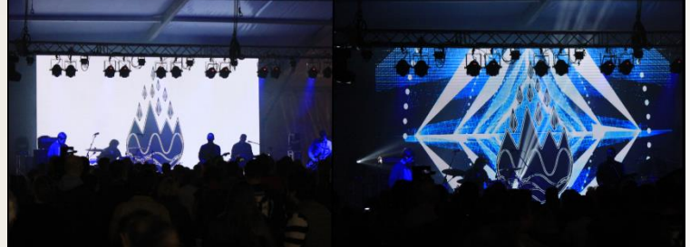
4.8mm LED Wall adjustable in size and shapes. Good for indoor and outdoor use. Contact your Sound Events Rep for more info.