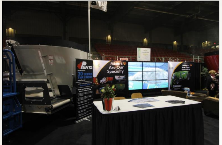
3X3 Samsung Monitor wall